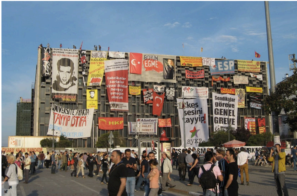
Occupy Gezi Architecture, documentation of temporary structures by Herkes İçin Mimarlık

As a multi-disciplinary platform Herkes İçin Mimarlık re-imagines the structure and scope of architectural processes. It focuses on creative ways to raise awareness about social challenges and mobilize communities in the pursuit of a social change. The organisation operates in both urban and rural contexts. With its projects, the organization leads volunteers in workshops that advocate environmentally responsible design as well as micro-economic development.