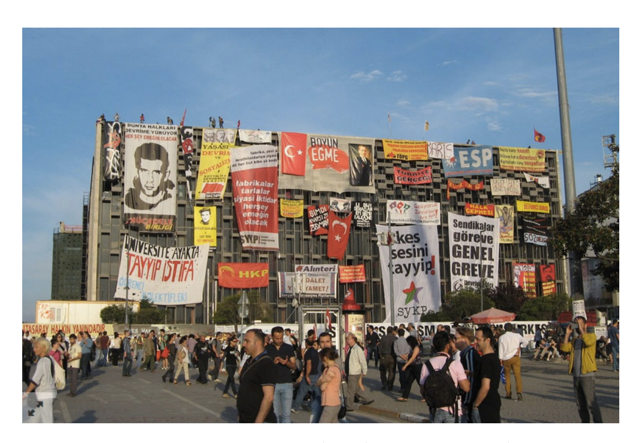
Occupy Gezi Architecture, documentation of temporary structures by Herkes Icin Mimarlik

As a multi-disciplinary platform Herkes İçin Mimarlık reimagines the structure and scope of architectural processes. It focuses on creative ways to raise awareness about social challenges and mobilize communities in the pursuit of a social change. The organisation operates in both urban and rural contexts. With its projects, the organization leads volunteers in workshops that advocate environmentally responsible design as well as micro-economic development.