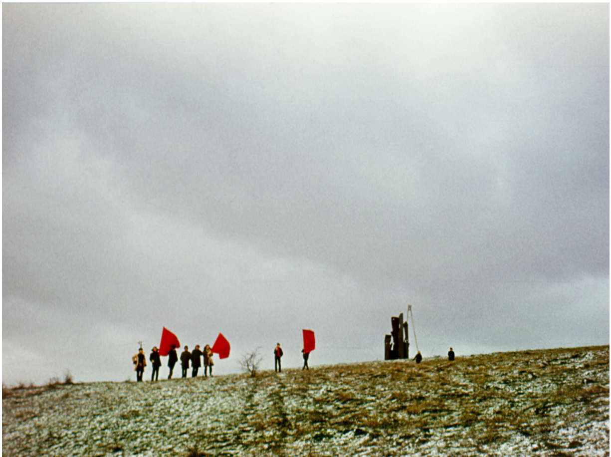
Still from Game on Morel's Hill (Group Action), 1971.